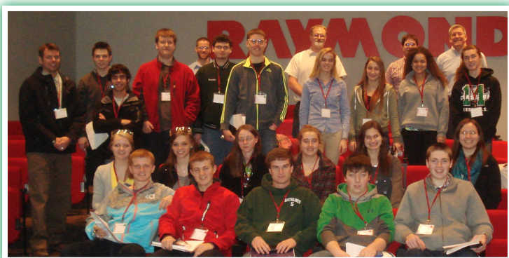
TC3 College Physics students with Raymond Engineers

The Raymond Corporation hosted the TC3 College Physics students from the Greene Central High School to provide students with a chance to apply their physics knowledge to real world engineering challenges connected with Raymond® lift trucks. The main focus of the event is to give students a chance to interact with real world applications of physics. The students see firsthand how engineers use physics to design, build, and manufacture lift trucks. Raymond® engineers setup a lab that tested the efficiency of the lift mechanism on a fork truck. Students took the measurements and performed the calculations. Raymond® prides themselves on the safety of their products. Raymond® showed the students many of their safety tests that are performed in their testing lab. Given one of the tests the students had to calculate the predicted result, and see if it matched the actual data measured in the testing lab. Thank you to the Raymond® team for helping to make students ready for college and future careers in the STEM field.